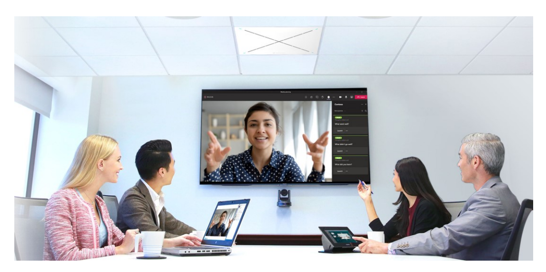
Video conferencing: Sennheiser and QSC help to make the experience more engaging Register for free online seminars and earn CTS credits

Wedemark, June 7, 2021 – Today's businesses are ever more reliant on video conferencing, and although the technology has been a true blessing during the pandemic, many participants feel that the whole experience could be a little more natural. In a joint online seminar, Sennheiser and QSC show how interactive technology can help to reduce the perception of distance and increase engagement from remote participants, and the important role that Microphone-Based Camera Steering can play in achieving this. Visit www.sennheiser.com/followme to register and learn more about the combined solution that brings together Sennheiser's touchless TeamConnect Ceiling 2 microphone and the QSC Q-SYS Ecosystem to make video conferences more natural and dynamic. The AVIXA-certified seminars are available in English and German through June and July. In addition, private demonstrations are possible too.